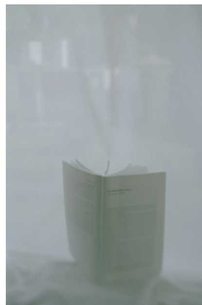
Book Still Life