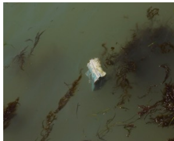
Book